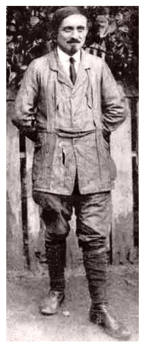
Émile Armand Date Unknown