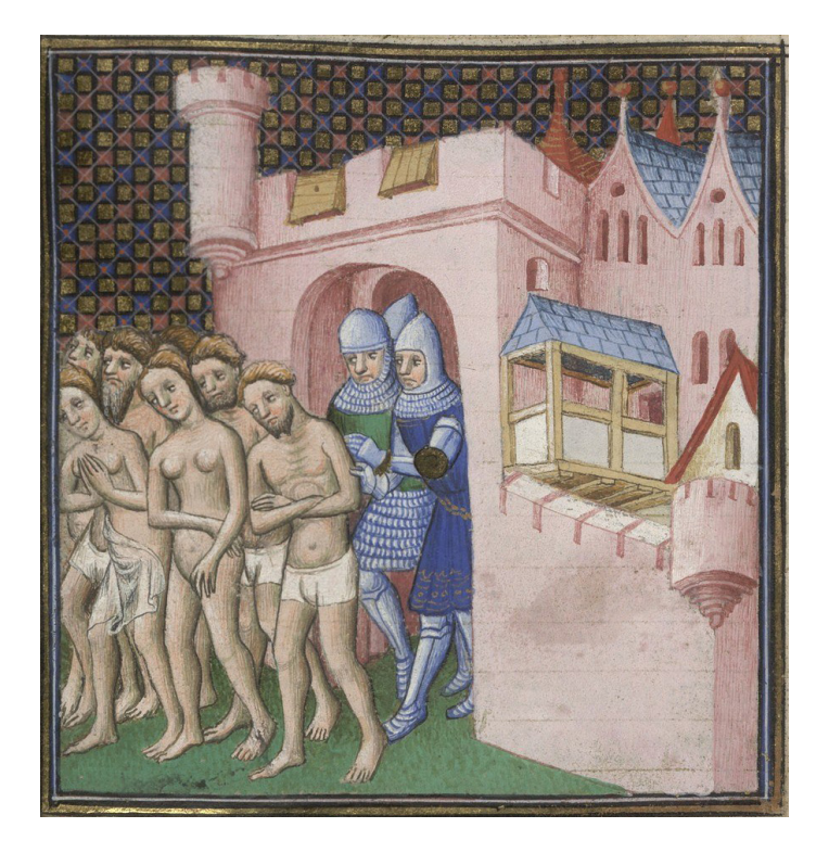
Expulsion of the Cathars circa 1415. Image extracted from the "Grandes Chroniques de France".